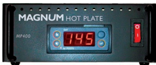
The heat goes on. 400W 220V AC

LAUREN MANUFACTURING CO. (PTY) LTD ONE CAROLINE STREET c/r 15TH STREET EASTGATE GARDENS COMMERCIAL PARK MALBORO SANDTON